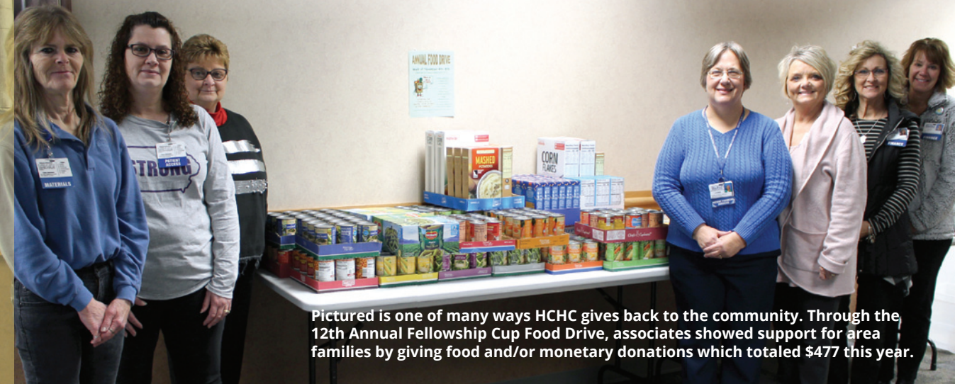
Pictured is one of many ways HCHC gives back to the community. Through the 12th Annual Fellowship Cup Food Drive, associates showed support for area families by giving food and/or monetary donations which totaled $477 this year.